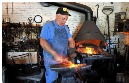
The village smithy at the anvil