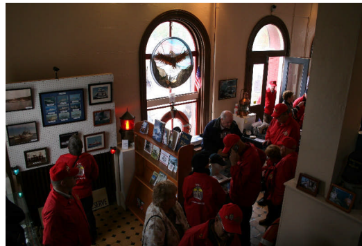
Touring the Museum