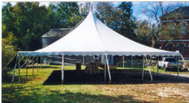
The Tent goes up