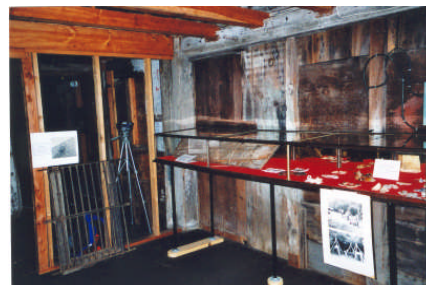
Some of the old jail artifacts