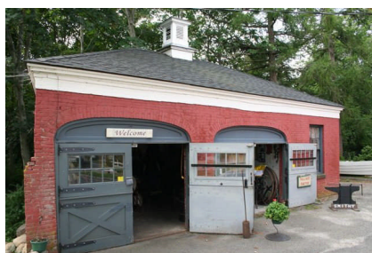
The old Blacksmith shop