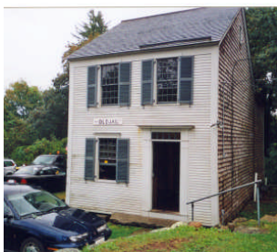
The old jail

The Old Jail's walls do talk. There are old inscriptions and drawings left by prisoners who were locked up in centuries past. This Halloween when you walk through do not be surprised if you are in the company of spirits from the past.