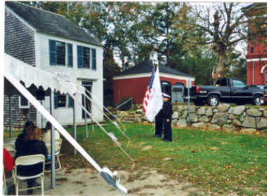
The Honor Guard