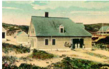
Early photo of Cahoon Station