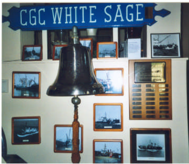
The White Sage Bell exhibit