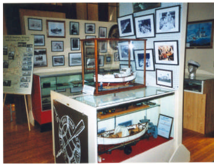
36500 and 26' motorized surfboat models