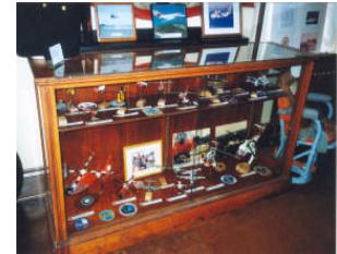
2nd floor aircraft models