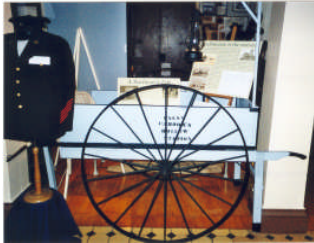
Cahoon Hollow utility cart